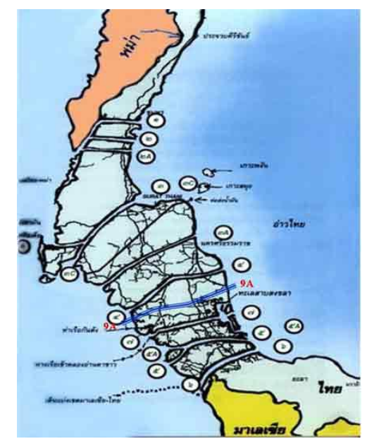
Image 1 Canal lines from the past to the present, total of 12 canal lines